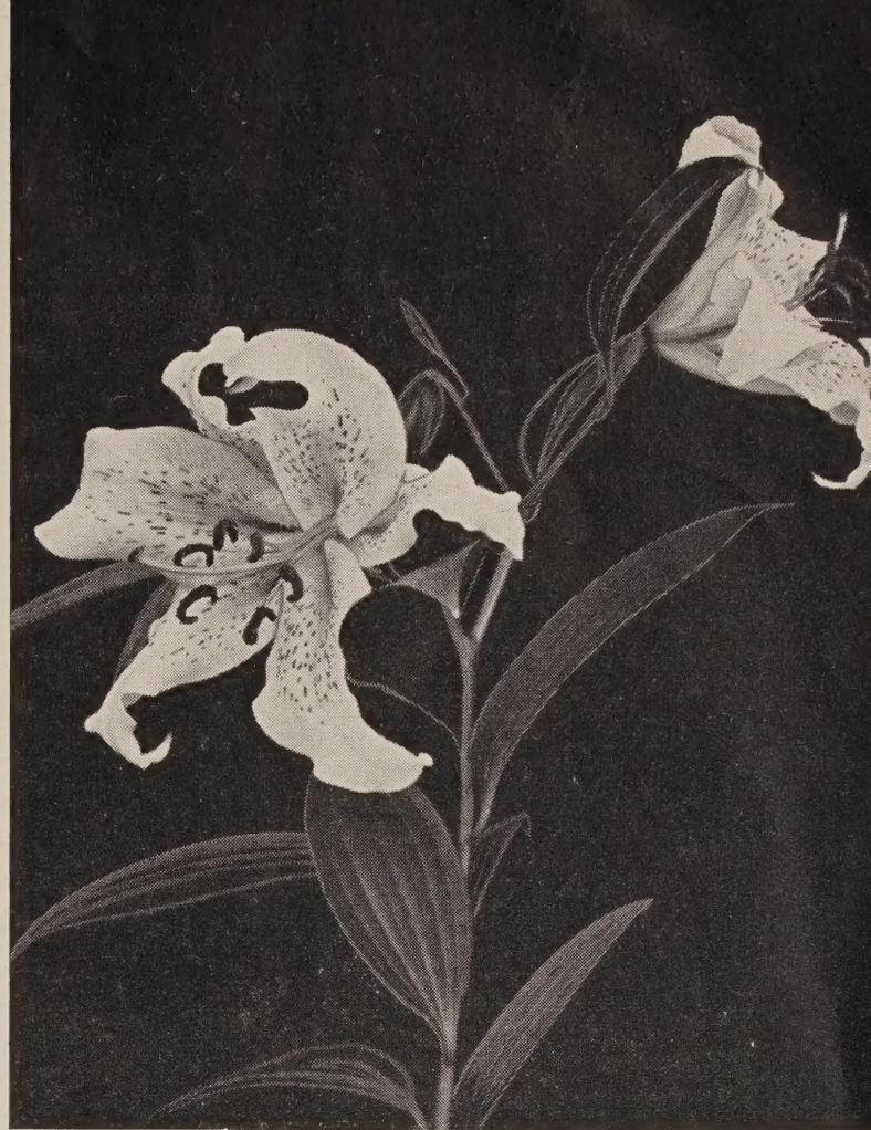
AURATUM—The Gold-Banded Lily